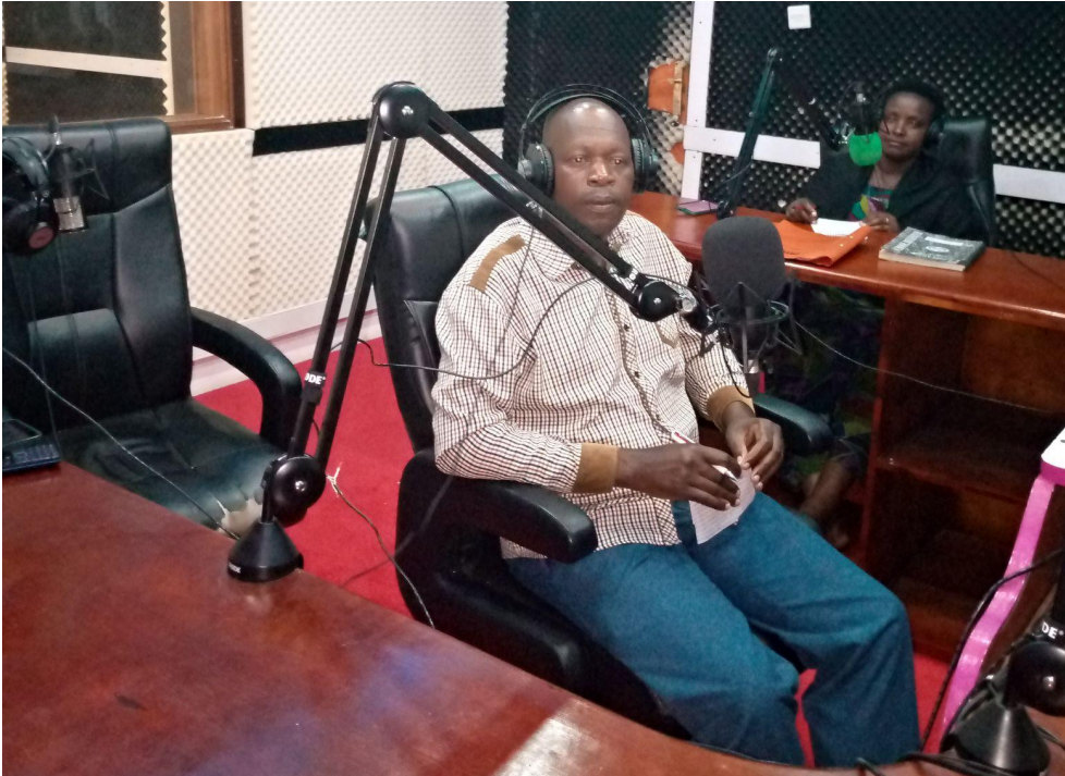
Kiruhura FM with OC Station