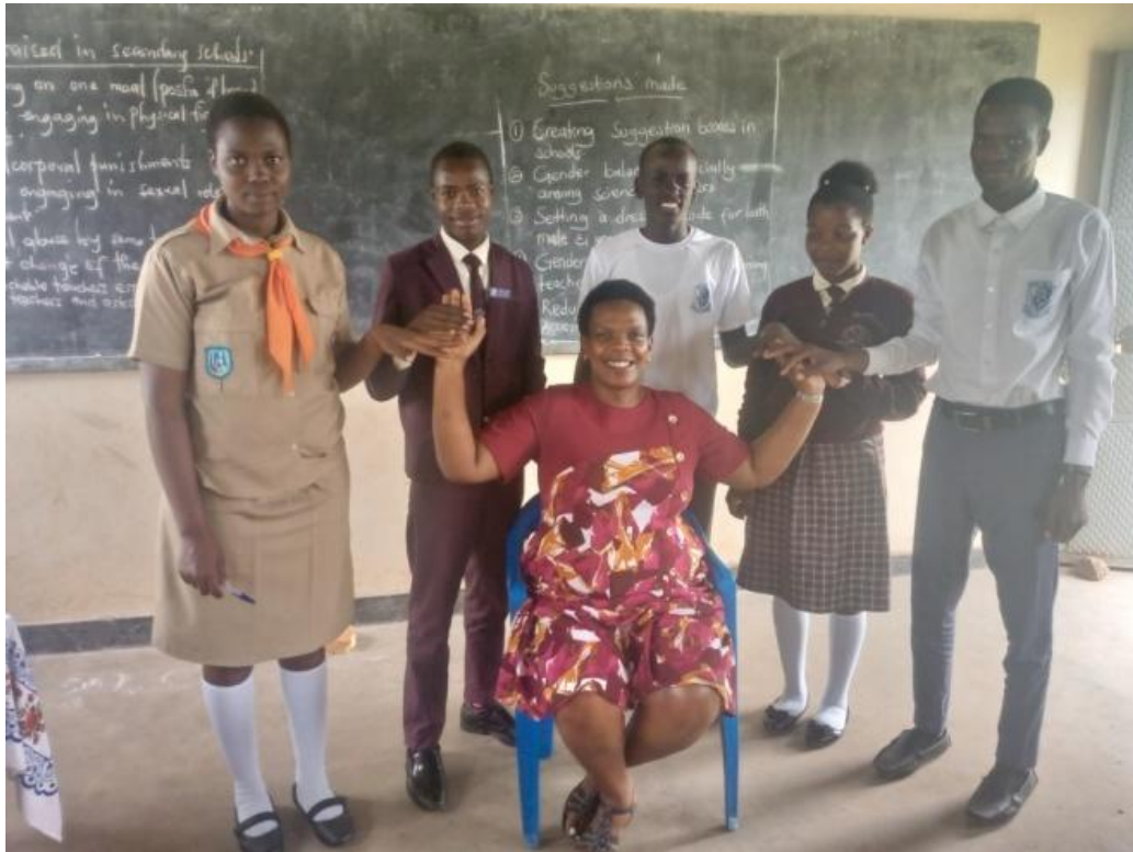
St. Peters' SS Prefectorial body